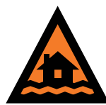
Watch and Act